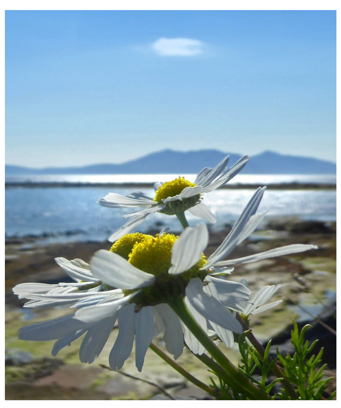
Summer at Seamill

West Kilbride Parish Church Magazine Issue No. 51 June/July 2018